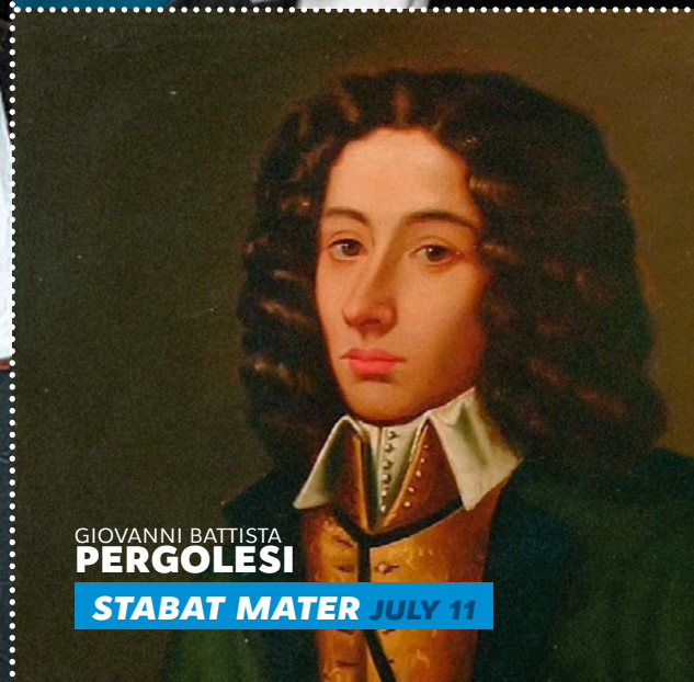
GIOVANNI BATTISTA PERGOLESÌ