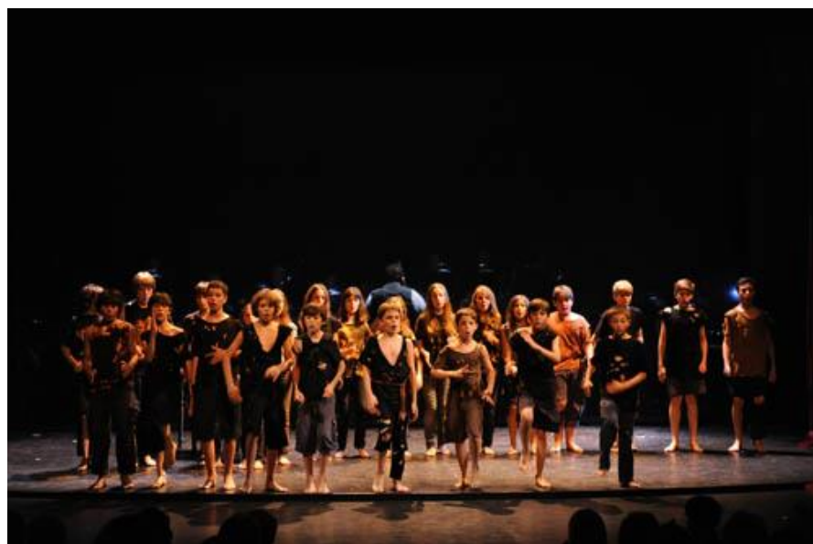
Choeur d'Enfants d'Ile-de-France (Children's Choir) in 2010, Bizet's CARMEN