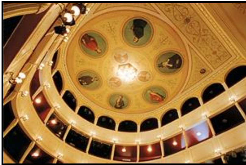
Ceiling of the Apollo Theater