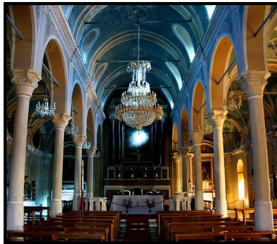
Saint George Roman Catholic Cathedral