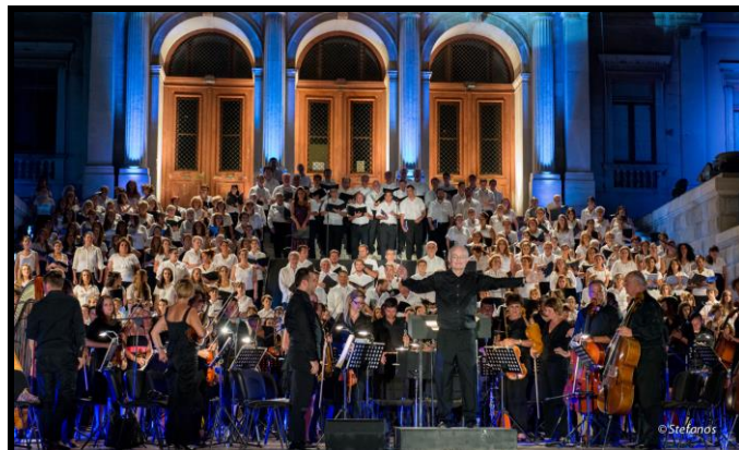
John Rutter conducts, Rutter's MAGNIFICAT "Under the Stars" - July 15, 2012