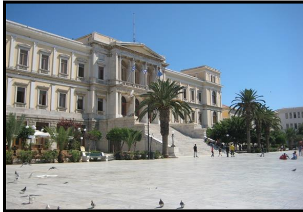
Miaouli Plateia and Syros Capitol Building of the Cyclades Location of the Finale Concert on July 17, 2014 10:00 PM, "Under the Stars"