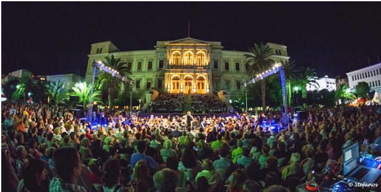
Peter Tiboris conducts, Aida in the Plateia, American, Canadian, & European Choirs Unite.