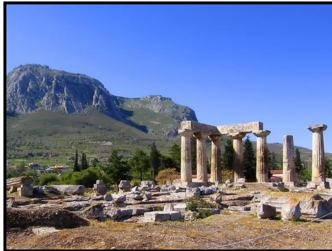
Ancient Corinth - Home of St. Paul the Apostle, 51-53 A.D.