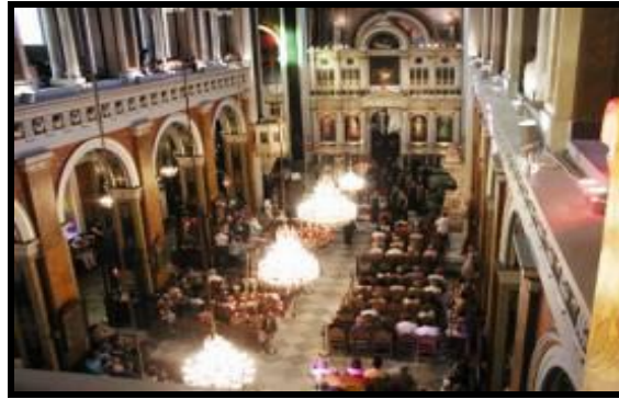
Saint Nicholas Greek Orthodox Church