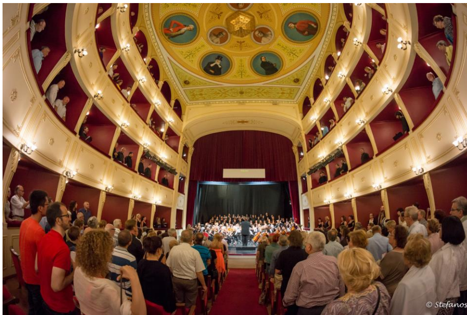
July 7, 2013 Verdi REQUIEM at the Apollo Theater

At the historic Apollo Theater "La Piccola Scala" on Greece's Island of Syros The 11th oldest opera house in Europe and the first opera house in Greece In its 151 th Anniversary Season (1864 - 2015)