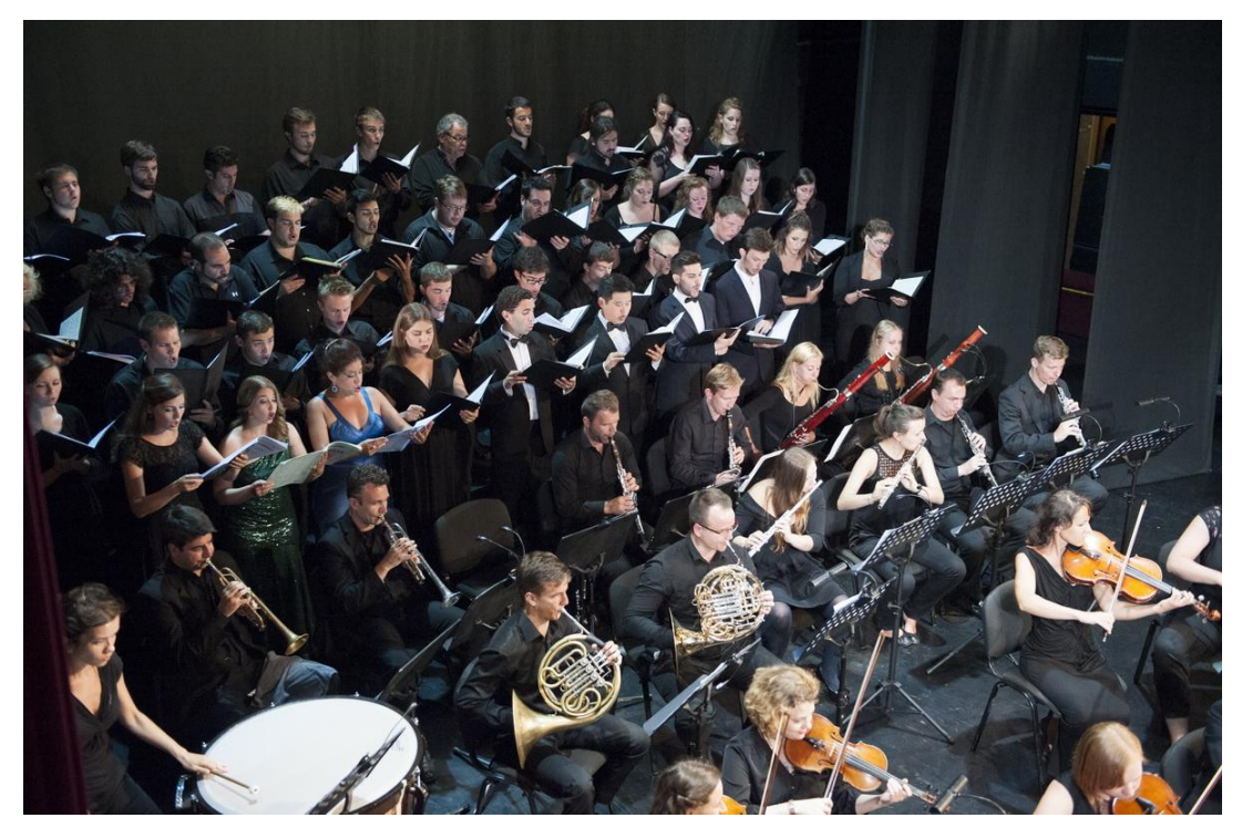
American Choirs sing Beethoven's Choral Fantasy with Pan-European Philharmonia, Maestro Peter Tiboris conducts Apollo Theater, Syros, Greece, July 19, 2015