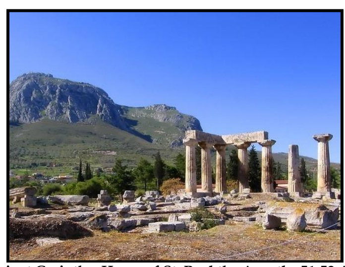
Ancient Corinth - Home of St. Paul the Apostle, 51-53 A.D.