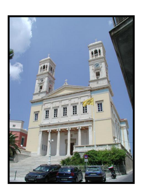
St. Nicholas Church