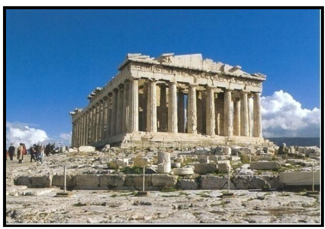
The Parthenon at the Acropolis

"Acropolis Now," an article on Athens tourism, from The New York Times' T Magazine : http://nyti.ms/UbSVrd