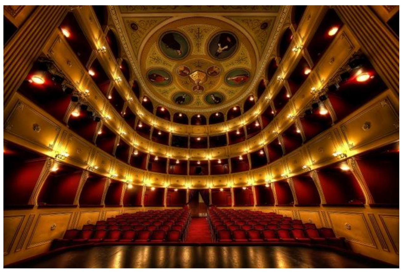
Apollo Theater

At the historic Apollo Theater "La Piccola Scala" on Greece's Island of Syros The 11th oldest opera house in Europe and the first opera house in Greece In its 152<sup>nd</sup> Anniversary Season (1864 - 2016)