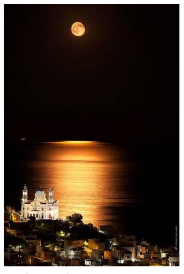
Scenes from Syros