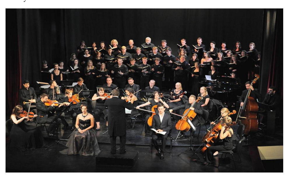
<u>Maestro William Wyman conducts Faure's Requiem with American Choirs and Pan-European Philharmonia on July</u> 13, 2015 at Apollo Theater in Syros, Greece