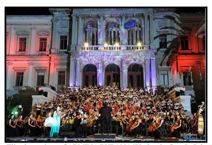
Maestro Peter Tiboris conducts, CARMINA BURANA "Under the Stars" - July 17, 2011