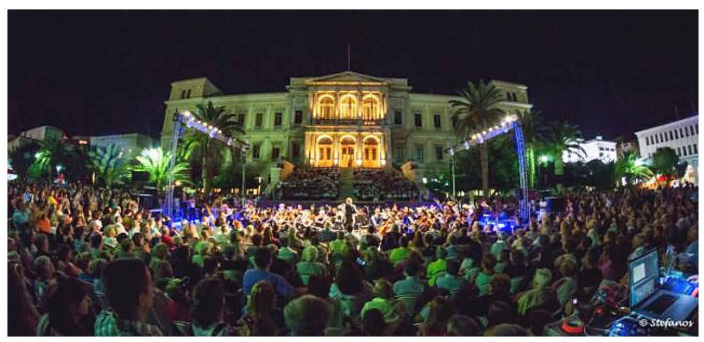
Peter Tiboris conducts, Aida in the Plateia, American, Canadian, & European Choirs Unite.

❖ Individual choirs can choose to participate in 20-minute solo sacred a cappella concerts in St. Nicholas Cathedral on our fourth annual "Sunset Series". Five choirs are presented consecutively in an evening of sacred a cappella choral music.