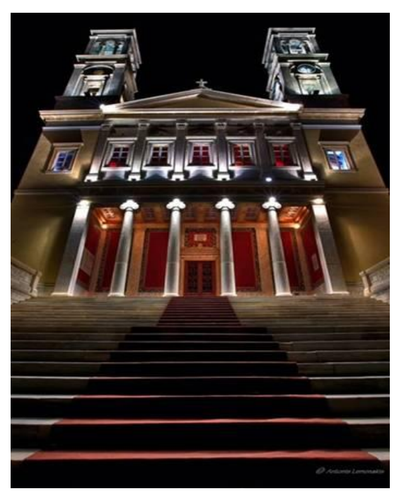
Front of Capital Steps where the "Under the Stars" concert is held

"...the music making is world-class; the Greek island setting is paradise; the venues in the city of Hermopoulis are wonderful; the audience is at capacity and enthusiastic; and the convergence of all of these factors are without peer in the world of choral music making." (July 2011)