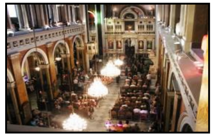
"Sunset Sacred Music Concert" Venues: Saint Nicholas Greek Orthodox Church