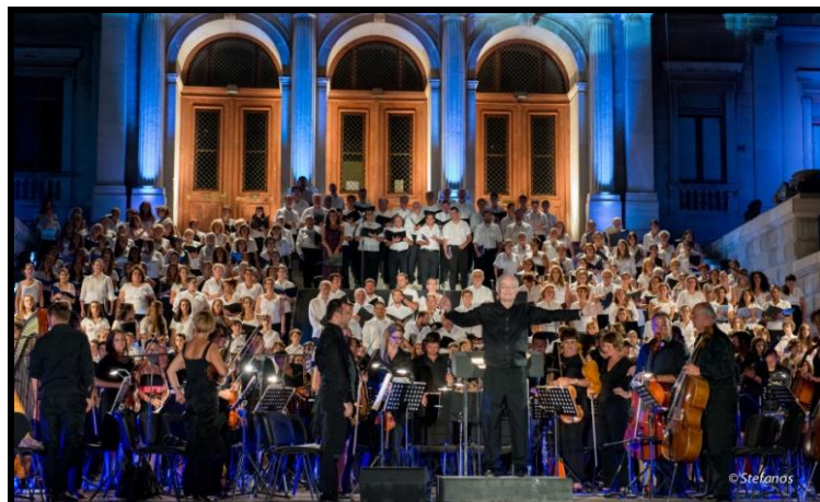
Maestro John Rutter conducts Rutter's MAGNIFICAT "Under the Stars" - July 15, 2012