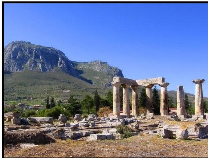
Ancient Corinth - Home of St. Paul the Apostle, 51-53 A.D.