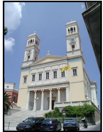
St. Nicholas Church