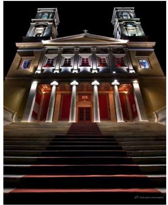
Front of Capital Steps where the "Under the Stars" concert is held

"...the music making is world-class; the Greek island setting is paradise; the venues in the city of Hermopoulis are wonderful; the audience is at capacity and enthusiastic; and the convergence of all of these factors are without peer in the world of choral music making." (July 2011)