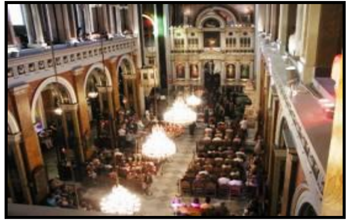
“Sunset Sacred Music Concert” Venues: Saint Nicholas Greek Orthodox Church