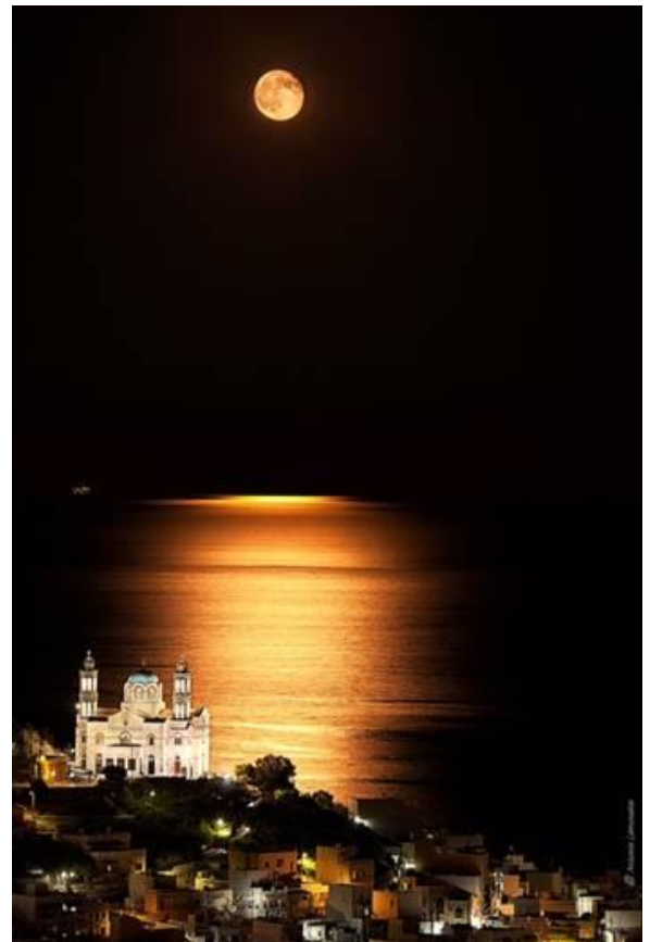
Scenes from Syros