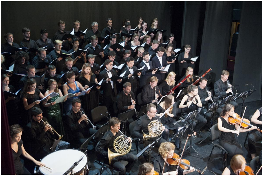
American Choirs sing Beethoven's Choral Fantasy with Pan-European Philharmonia, Maestro Peter Tiboris conducts Apollo Theater, Syros, Greece, July 19, 2015