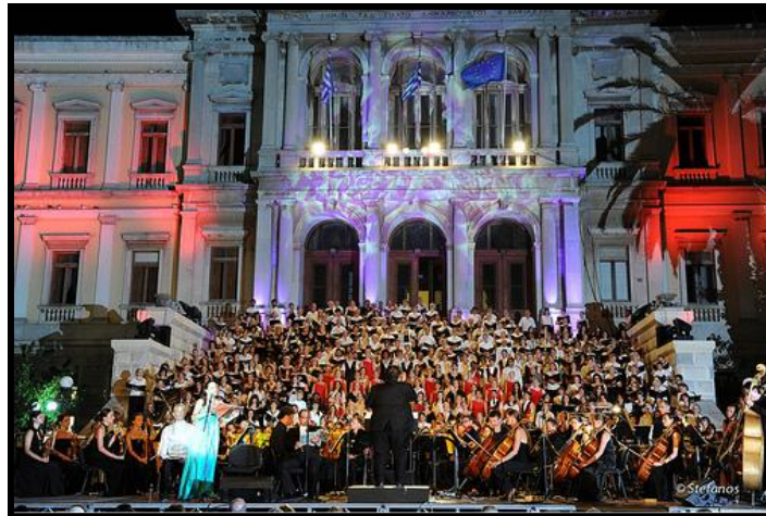
Maestro Peter Tiboris conducts, CARMINA BURANA "Under the Stars" - July 17, 2011