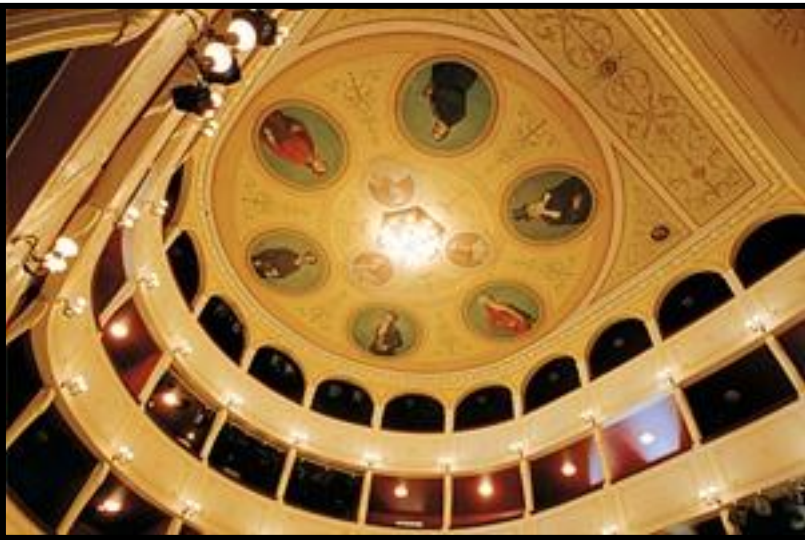
Ceiling of the Apollo Theater