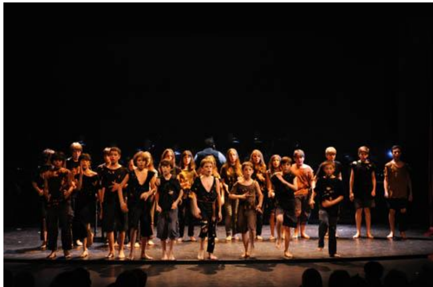
Choeur d'Enfants d'Ile-de-France (Children's Choir) in 2010, Bizet's CARMEN