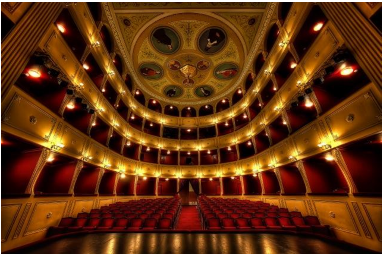
Apollo Theater

At the historic Apollo Theater "La Piccola Scala" on Greece's Island of Syros The 11th oldest opera house in Europe and the first opera house in Greece In its 153 rd Anniversary Season (1864 - 2017)