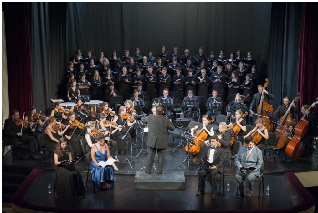
Maestro Peter Tiboris conducts Mozart’s Coronation Mass with American Choirs and Pan-European Philharmonia on July 19, 2015 at Apollo Theater in Syros, Greece